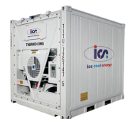
Cold Storage Cooling Solutions down to -60°C