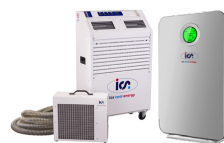
Portable Air Con & Air Purification