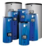
Domestic Hot Water 150kW to 1300kW