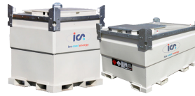
Fuel Tanks 978L, 2900L & 900L