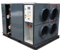
Air Handling Units 10kW - 350kW