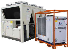
Air & Water Chillers 3kW - 1290kW