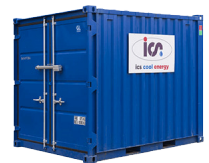
VLT Chillers Cooling Solutions down to -40°C