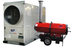
Diesel Heaters 70kW, 100kW & 200kW