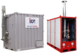
Oil, Gas & Steam Boilers Up to 200kW