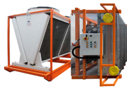
Dry Air Coolers & Free Cooler 3kW - 1290kW