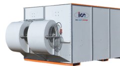
Cooling Towers Supporting duties up to 2MW