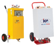
Electric Boilers 3kW to 40kW